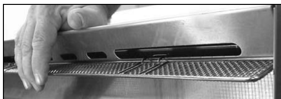
The filter screen snaps into place on the air-intake tower.

The filter screen is designed to prevent debris from entering the cowl assembly and clogging the blower. Slip the part over the vent opening on the ON/OFF switch side of the unit. The filter screen snaps into position.